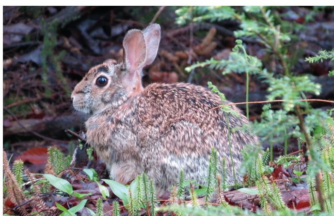
Appalachian Cottontail, D. Gross

New users must register for a free account which will allow them to create and save projects and generate reports. The Quick Start Guide and Help menu will get you started.