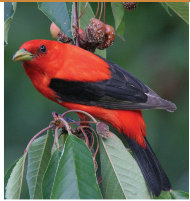
Scarlet Tanager