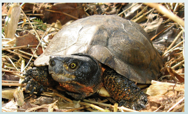
Wood Turtle, K. Gipe, PFBC

The COA Tool expands access to core components and facilitates use of the Pennsylvania Wildlife Action Plan. The Pennsylvania Wildlife Action Plan guides conservation actions to secure Species of Greatest Conservation Need and their habitats and is filled with important information about species, habitats, environmental stressors, needed conservation actions and more.