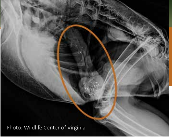
This x-ray shows lead fragments within the gastrointestinal tract of a bald eagle.