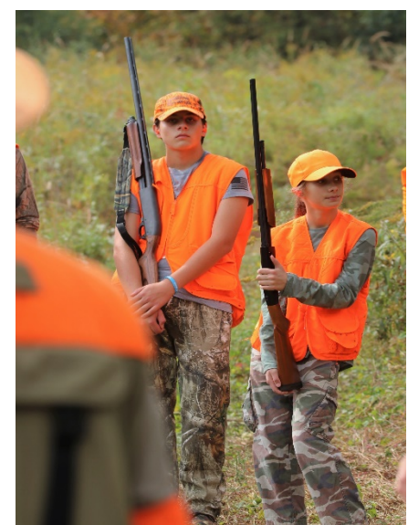
Brother and sister await the start of the hunt, listening to the group instructions.