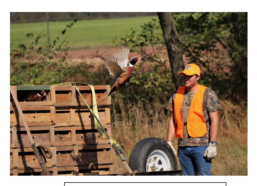
Ring-necked Pheasants launch from the wooden crates during stocking prior to the hunt..