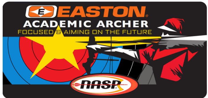
AA Decal and Patch