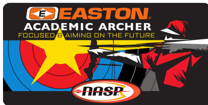
AA Decal and Patch