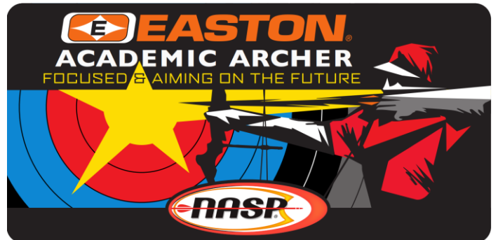
AA Decal and Patch