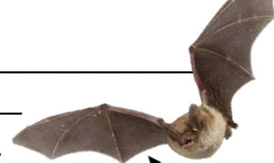
Northern-long eared bat