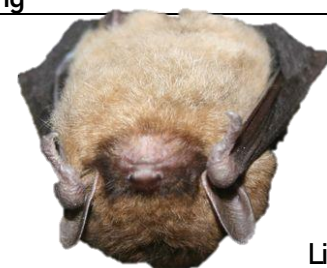
Little brown bat