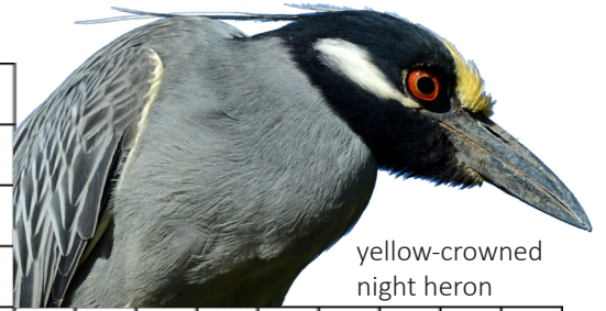
yellow-crowned night heron