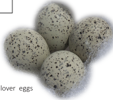
piping plover eggs