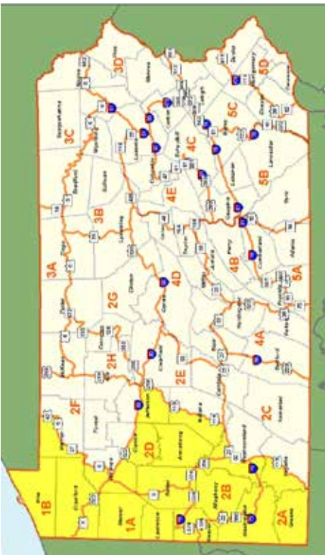
Antler restrictions: Three Up in WMUs 1A, 1B, 2A, 2B & 2D.