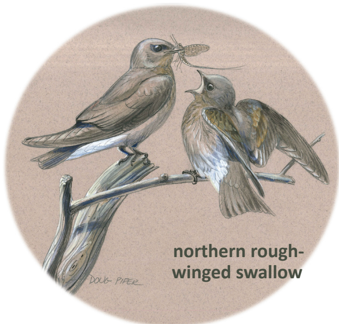
northern rough-winged swallow

Tree swallows nest across Canada and most of the northern United States. They are five to six inches long, an iridescent green-black or blue-black above and bright white below. They nest in tree cavities, woodpecker holes, and bluebird houses put up by humans. The earliest of our swallows to return north, they arrive in mid-March in southern counties and late March and April in northern counties and at higher elevations; unlike the other species, tree swallows switch to eating berries and seeds to survive cold periods when insects become torpid. They often breed near the still waters of lakes, ponds and marshes, competing for nest cavities with bluebirds, starlings, house sparrows, and house wrens. Ornithologists believe that individuals choose new mates each year. Tree swallows are more aggressive than other swallow species and defend an area within a radius of about 15 yards from the nest. Bird box trails often include double boxes on a pole to allow both