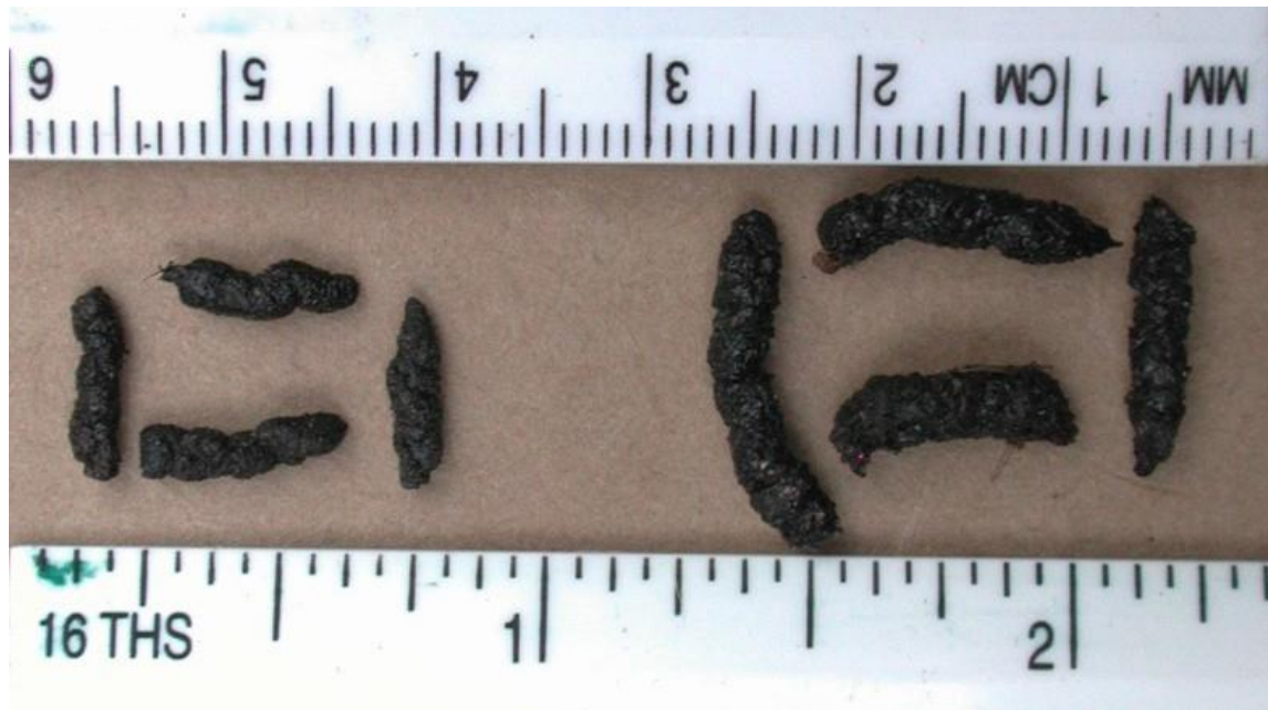
Guano comparison: Little brown (left) vs. Big brown (right)