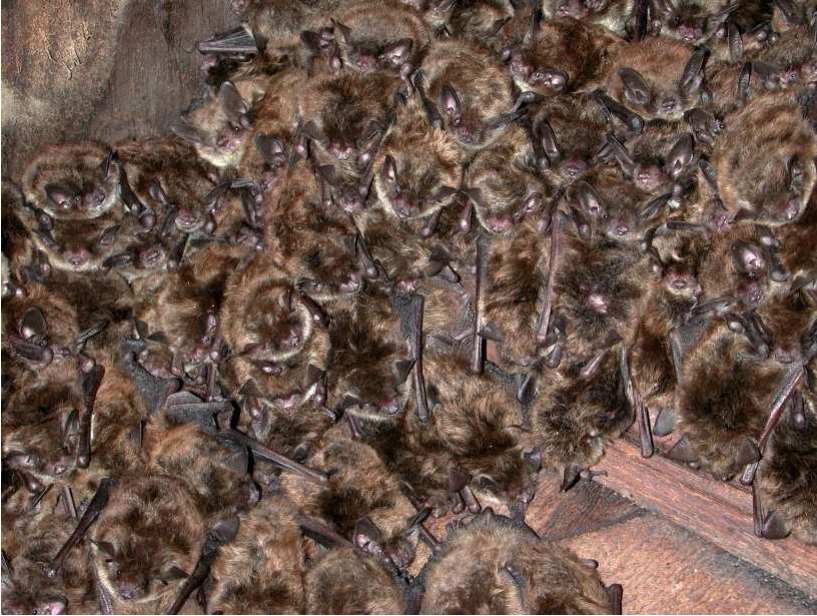
Note the small nose and short, uniformly dark brown fur on the back.