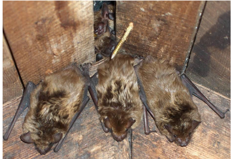
Note the larger nose and long, silky fur of big brown bats.