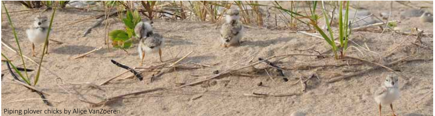
Piping plover chicks

MANAGEMENT PROGRAMS: Piping plovers, particularly in the Great Lakes population, are one of the most intensively managed endangered species given their small breeding populations and high vulnerability to disturbance. Nests are protected by predator exclosures that allow entry and exit for the plovers but deter predators. These exclosures are coupled with a larger “closed area” that enables the birds and their chicks to forage safely without disturbance. Plover monitors keep track of the nests daily, noting when birds were first seen, when eggs were laid, when they hatched, and how many chicks fledged. Since 1993, individual plovers (adults and chicks) have been marked with uniquely colored leg bands to better understand movements of breeding birds within the breeding range and between the breeding range and the wintering areas, survivorship, mate retention, and dispersal.