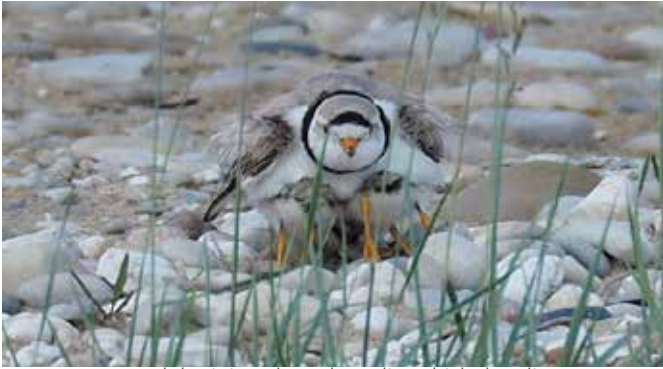
Adult piping plover brooding chicks

BIOLOGY-NATURAL HISTORY: Piping plovers begin arriving on their breeding grounds by mid-April. Males typically arrive before females to establish a territory, usually in the same location as the previous year, if the male had successfully found a female. The same female will likely join him if they successfully raised young the previous year. Following a brief courtship of aerial flight displays, scraping, and pebble-tossing, egg-laying begins in a small, bowl-shaped, pebble/shell-lined scrape in the sand. The female lays one egg every 1.5 days until the full clutch, typically four eggs, is complete. Incubation begins after the fourth egg is laid. The adults trade incubation duties for 28-31 days until hatching. Plover chicks can walk and feed themselves almost immediately after hatching (i.e. precocial), gleaning insects as they dart around the shoreline like cotton-balls with legs. For the first week, chicks are not able to regulate their body temperature and must be brooded (sheltered) by either adult to survive. Both adults tend to the chicks, leading them toward food resources and away from harm, until the chicks can fly in about 30 days.