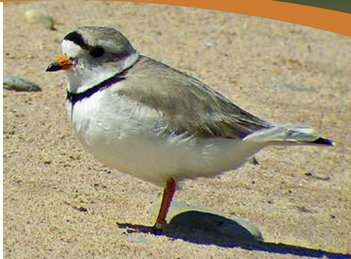
Adult piping plover

POPULATION TREND: Historically, several hundred pairs of Great Lakes piping plovers nested on every Great Lakes shoreline. Until the mid-1950s, about 15 breeding pairs nested regularly on Gull Point at Presque Isle State Park, Erie County. When the Great Lakes population was granted federal protection under the Endangered Species Act in 1986, only 17 breeding pairs remained and all were restricted to the state of Michigan. In 2017, the Great Lakes population grew to 76 breeding pairs found in four U.S. states and Ontario, Canada. Piping plovers are rare but regular fall and casual spring migrants at Presque Isle State Park. In 2011 and 2012, historic nesting habitat in the Gull Point Natural Area was restored through federal funding. Piping plovers had briefly visited nesting habitat at Presque Isle State Park during spring and fall, renewing hope for the