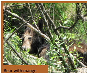
Bear with mange

The clinical signs of mange are a result of damage to the host's skin by the burrowing mite and the reaction of the host's body to the mite. Bears with mange are often itchy and observed continuously scratching their head or rubbing it against objects. Affected skin will have varying degrees of hair loss resulting in areas of thin fur or completely bald patches. The underlying skin is thickened, dry, covered by scabs or tan crusts, and often has a foul odor. The extent of these skin lesions is variable ranging from the ears and face in mild to moderate cases to lesions covering almost the entire body. Severely affected bears are typically emaciated, depressed and often found wandering apparently unaware of their surroundings.