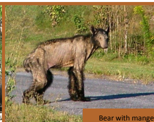
Bear with mange