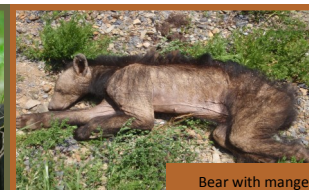
Bear with mange