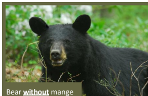
Bear without mange